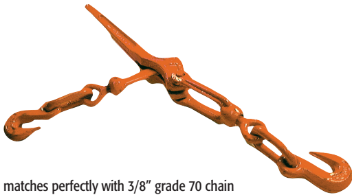
Part# 10036MD 5/16"-3/8" chain 6600# WLL which matches perfectly with 3/8" grade 70 chain which is also rated at 6600# WLL