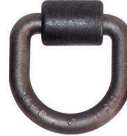
Part# 80138 3/4" Forged Steel w/ Weld-on Clip