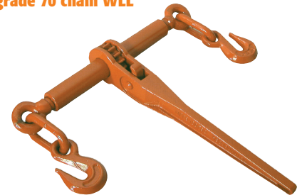
Part# 10035MD 5/16"-3/8" chain 6600# Working Load Limit which matches 3/8" Grade 70 Chain which is also rated at 6600#WLL

For more information please contact our customer service team: