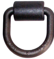
Part# 80137 5/8" Forged Steel w/ Weld-on Clip