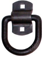
Part# 80135 1/2" Forged Steel w/ Bolt-on Clip