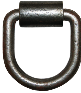
Part# 80136 1/2" Forged Steel w/ Weld-on Clip