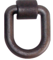
Part# 80139 1" Forged Steel w/ Weld-on Clip